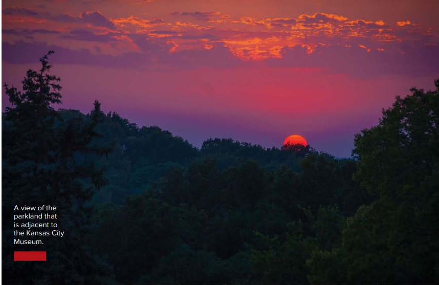
A view of the parkland that is adjacent to the Kansas City Museum.

in collaboration with our teacher and youth advisory councils. Some topics will connect Kansas City history to school curriculum, including the Indian Removal Act of 1830, racial residential discriminatory practices, women’s suffrage, and civil rights and desegregation. Other topics will cover the impact of COVID-19 on students and teachers and the disparities exposed by the pandemic.